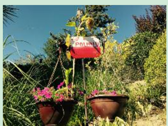
The birds and bees love the towering sunflower growing between pots of petunias advertising Gieryng's homeland, Poland.