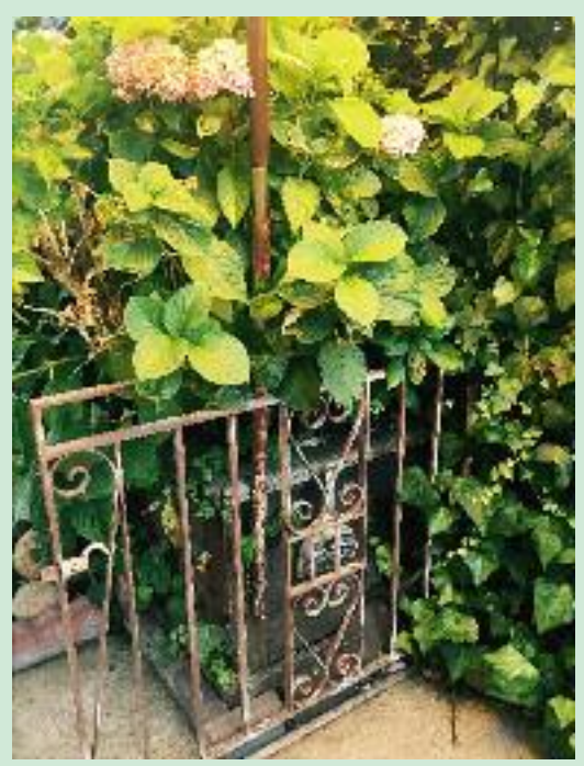
Hydrangeas highlight a chunk of tossed out wrought iron.